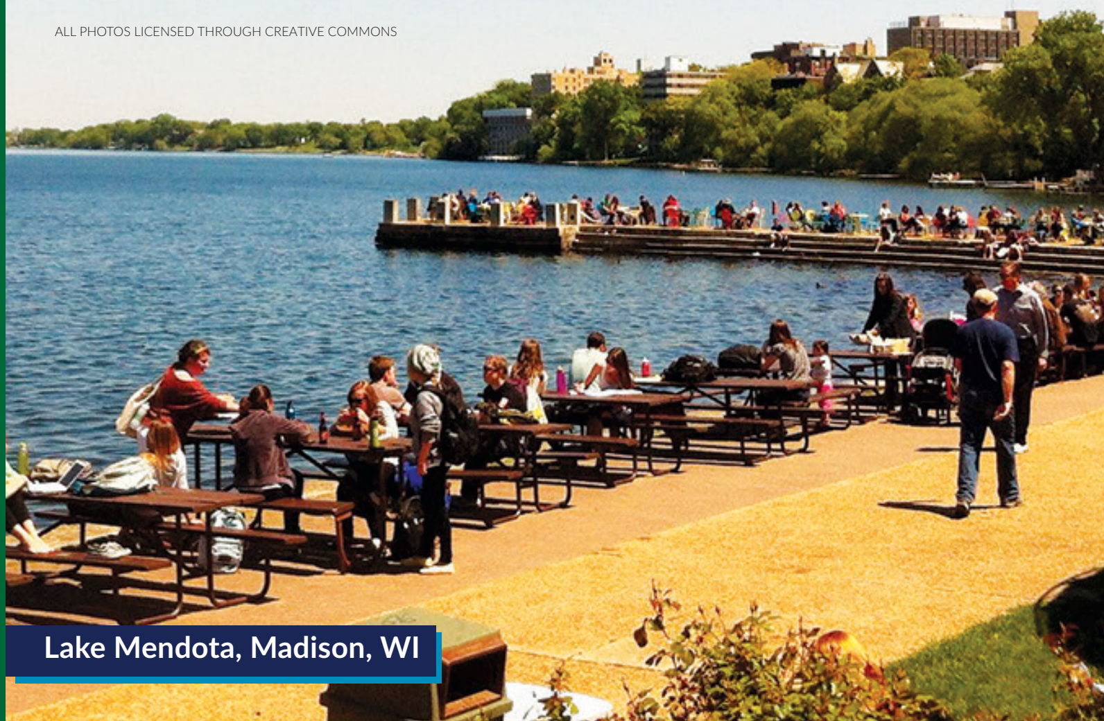
Lake Mendota, Madison, WI

ALL PHOTOS LICENSED THROUGH CREATIVE COMMONS